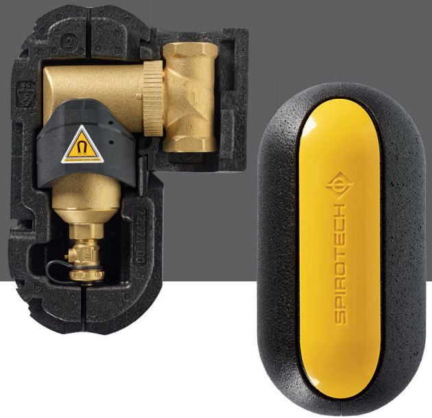
SpiroTrap MB3 with Insulation*

SpiroTrap MB3 and Spirotrap MBL are highly effective, powerful dirt separators for removing both magnetic and non-magnetic dirt particles from the system water. Available in connection sizes 22 mm, 28 mm, ¾", 1", 1¼", 1½" and 2".