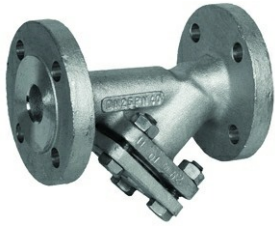
Fig. 1046 Y filter