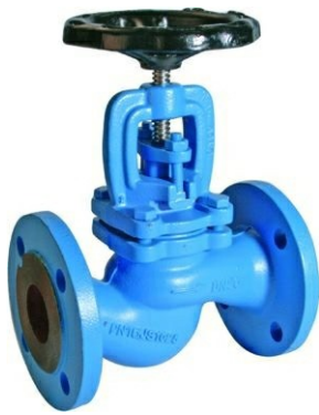
Fig. 247 Globe valve