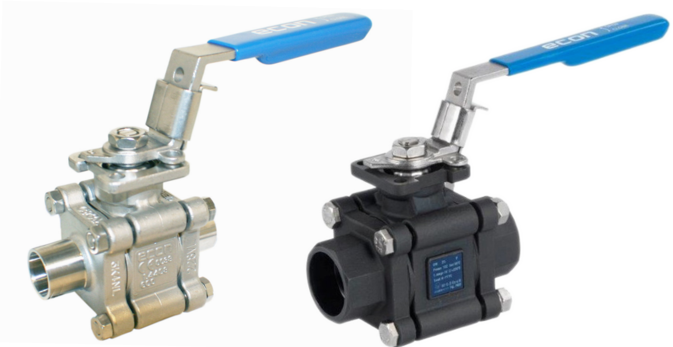
Type 1351 stainless steel