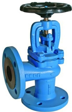
Fig. 242 Globe valve